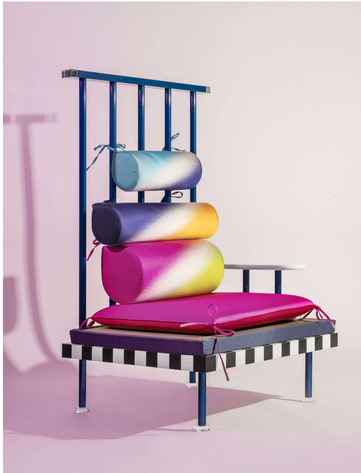
Masanori Umeda, 'Utamaro' sofa, 2020

The main focus here was the latest collection of furniture designed by Masanori Umeda entitled 'Utamaro'. Just as with his 'Tawara' boxing ring – made famous by the Memphis group picture in 1981 – the various seats combine a traditional Japanese aesthetic with flashy colours, tubular metal structures, asymmetry, flamboyant silks and lacquered surfaces.