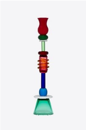
"Tuja" Vase in Ceramic Yves Saint Laurent ysl.com $475.00