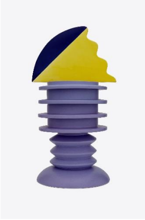
"Ananke" Vase in Blown Glass Yves Saint Laurent ysl.com $6,100.00